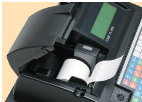
'Drop-in' paper loading mechanism helps users to change paper instantly.