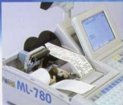
'Drop-in' Paper Loading Mechanism