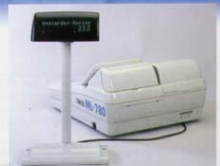
External Customer Display (Option)