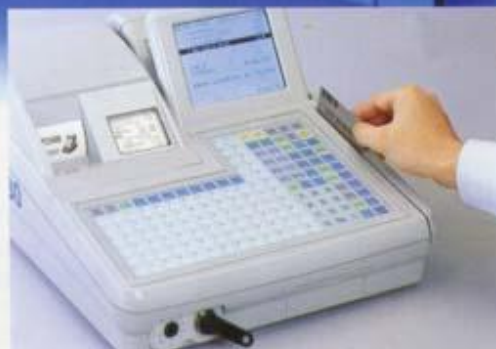
Magnetic Card Reader/Server ID Key (Option)